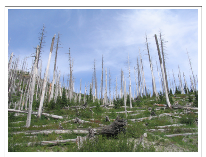
Fig. 2.3. Standing dead zone along FR-99. A. Standing dead and toppled trees with slide alder and grasses (July 30, 2004); B. After 31 years, many stems have toppled as the standing dead zone is being transformed into a zone where the fallen stems are gradually incorporated into the soil (August 15, 2011).

The blast zone has three regions. Within 10 km of the crater, most vestiges of vegetation were removed (tree removal zone; see Chapter 4). More distant, trees were killed, but snow protected understory vegetation in localized patches. This outer part of the blast zone includes two regions dominated by forest remains: the blown-