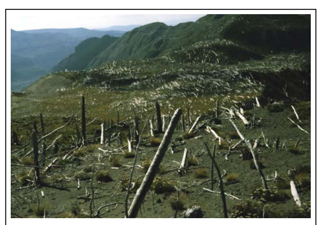
Fig. 2.10. Lower Toutle Ridge on the transition from blast zone to blow down zone. Site was on the west edge of the blast, but within 2 km of the crater. Conifers were young and flexible, so most resisted the blast, but their needles and branches were stripped. Snow cover was limited; so much of the understory was also removed (August 10, 1981).

blown-down zone. Litter (primarily dead leaves that fell during the summer) formed a protective barrier against rain and tephra deposits were thinner and conformed to