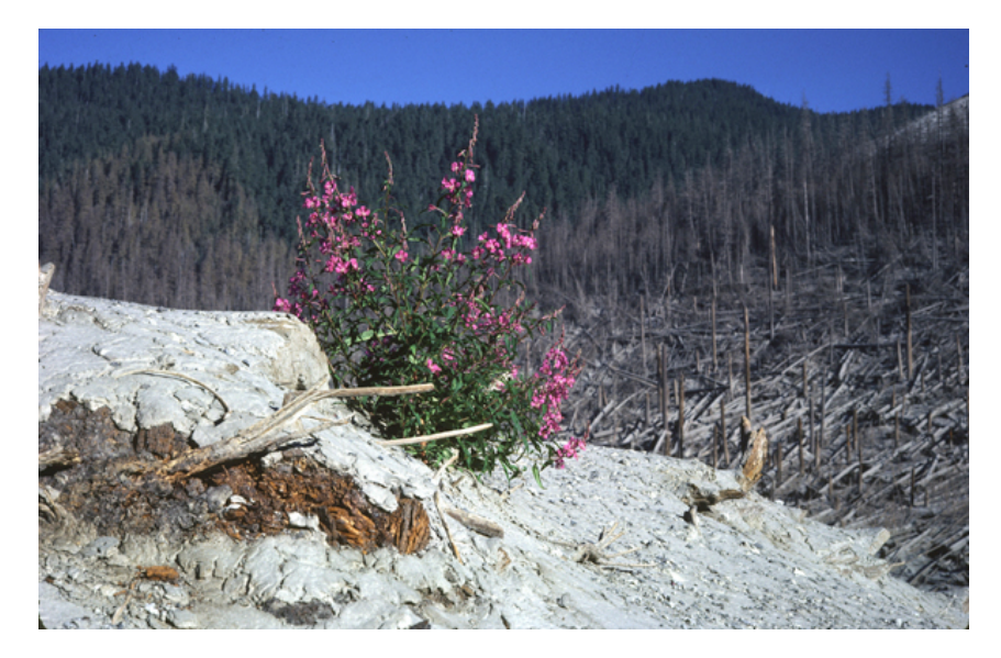
Surviving fireweed emerges from blast and tephra near Ryan Lake (August 20, 1980).