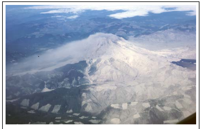
Fig. 2.1. Aerial view of the blast zone, showing the 170° arc of the blast. Scorch and blown-down forests can be seen in the foreground. Abundant clear-cuts and the Muddy River Lahar are also prominent (July 30, 1980, from a commercial airplane).

forces create massive swaths of jumbled forest remnants. For example, hurricanes devastate coastal areas, flattening forests, leaving behind impenetrable thickets. While damage decreases from the coast, it increases with the stature of the forest. Stems are broken and trees are uprooted. Topography can protect parts of the forest, to form a mosaic of damage. Hurricane Katrina (2005) killed 320 million trees along 5 million coastal acres. The decaying forest pumped as much carbon into the air as was absorbed by all U.S. forests that year. Forests can recover from hurricanes in many ways, including crown sprouting, so that the secondary succession is relatively rapid.