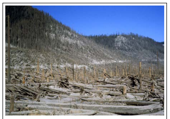
Fig. 2.5. Clearwater blown down zone: Fireweed dominates the immediate plant response to the blast in the (August 20, 1980).

During the summer of 2008, traffic along the FR-99 was blocked beyond Bear Creek Lookout by a landslide that collapsed half of the road for several hundred meters. Although the road was passable, the public was excluded by a locked gate. We had permission to enter, and that was a lonely summer. On our last trip, we were shocked to find a large tent pitched just off the road. Later that day, we met the location manager for a film crew shooting a movie. She said the movie was "a postapocalyptic tale of a man and his son trying to survive by any means possible," based on Cormac McCarthy's novel. Her crew and star Viggo Mortensen were there, but they were just filming "atmosphere." We went about our business. That evening, we were slowly driving up the narrow "Trail of Terror" (see Sidebar 8.1) when a guy flagged us down and asked us politely to find a turn out. Such things scarcely exist on this extension of FR-99, but, as if by magic, one appeared. As we waited, we were dumbfounded to see two (!) large boom trucks, lumbering slowly down towards the Pumice Plain. In places, they had less than 10 cm clearance. They must have made it back because I recognized a few landscapes in the movie. The young women in my group that year could talk of nothing except about seeing Viggo at the commissary tent. The young men, and me too, lamented that the co-star, Charlize Theron, was not there.