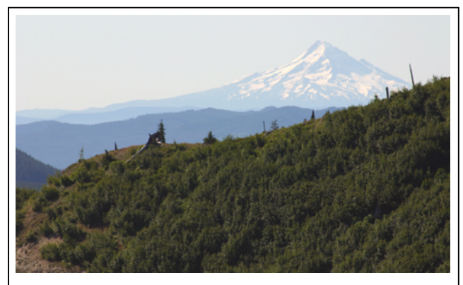
Fig. 2.9. Rapid recovery of saplings and understory vegetation was common on protected, north facing slopes such as this slope above Bean Creek (August 16, 2011).

The general pattern of recovery in the blown-down and seared areas was evident in the earliest studies (e.g., McGee et al. 1987). Understory cover was about 3% where a snow pack had existed during the eruption and barely measurable in sites on warmer slopes and at lower elevations. Typically, plots had eight species compared to two in snow-free sites. Recovery was more rapid at increasing distances from the crater where tephra deposits