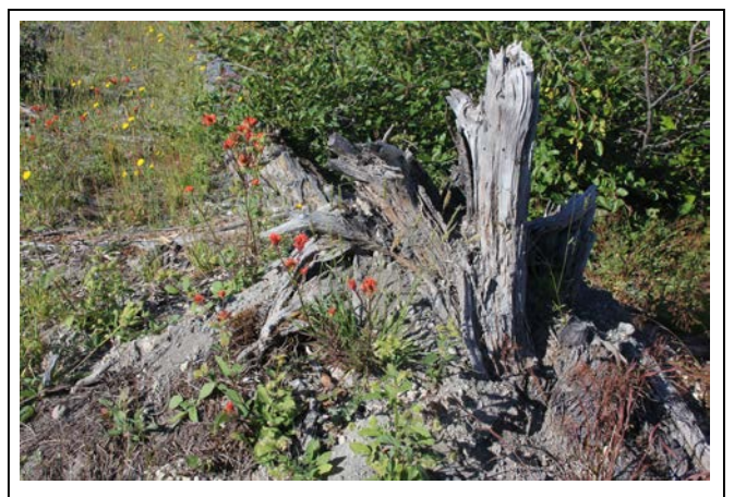
Fig. 2.13. Nurse effects from destroyed trees have lasted decades. Here, on an exposed ridge, the remnant of a subalpine fir provides protection, enhance fertility and greater moisture for invading species that include slide alder, paintbrush, wood rush, waterleaf and various grasses.