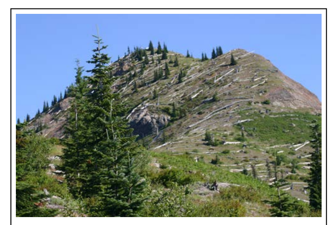
Fig. 2.7. Near Norway Pass, the forest is in recovery; downed trees provide erosion control and habitat for a variety of plants, mammals, birds and insects (August 16, 2011).

Today, the standing dead forest is starting to topple as supporting roots rot and can no longer support the boles. However, downed trees of the blown-down zone still remain visible but somewhat obscured by understory vegetation and soil development. They are gradually being buried by soil build up, by compression from winter snow