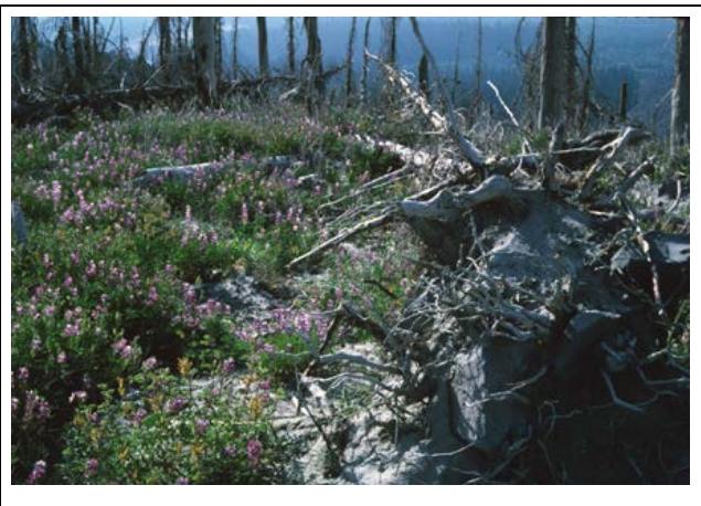
Fig. 2.6. Near the eastern boundary of the blast, on Pine Creek Ridge, trees were killed, but the understory of Cascade lupine, bear grass and sedges recovered quickly (August 12, 1981).

The distance from the crater to the edge of the blown-down zone varied with topography. The force of the blast was attenuated to the east and west of the main direction of the blast. Thus, on Pine Creek Ridge, on the eastern blast boundary, trees died, but remained standing, and the snow protected a lush understory. In August 1981, Cascade lupines and bear grass formed a dense understory that protected the slopes from further erosion (Fig. 2.6).