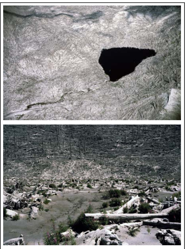
Fig. 2.4. Ryan Lake was devastated by the blast: Top. Surrounded by toppled trees and dense covering of tephra (July 8, 1980); Bottom. Scattered forbs are pushing through the ash, aided by summer rains. Note the elk tracks in mud (August 20, 1980).

down zone and the seared zone of standing dead trees. Outer boundary of the blast zone is irregular, responding to topographic factors. The seared zone, however, has a surprisingly regular width to form the transition between toppled trees and the tephra fall zone. The seared zone occupies about 110 km<sup>2</sup> of forest where the force of the blast neither toppled most trees nor even removed the leaves, but the heat of the blast killed needles and buds (Fig. 2.2). These dead needles soon turned russet, but