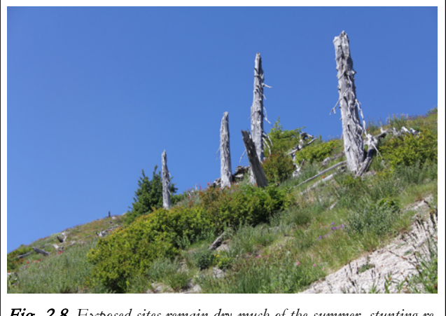
Fig. 2.8. Exposed sites remain dry much of the summer, stunting recovery (August 17, 2011).

South facing slopes in this region are generally expected to recover from disturbances more slowly than north facing ones due to greater drought and exposure to wind. On Mount St. Helens, they were also fully exposed to the blast and had the least snow to protect the ground layer vegetation. These sites remain impoverished (Fig.